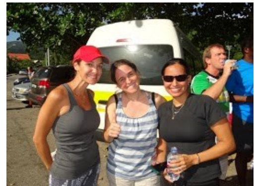
Virgins looking forward to the hash!