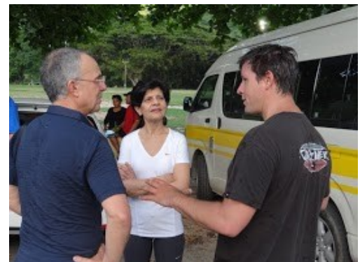
I guess some hash advise taking place